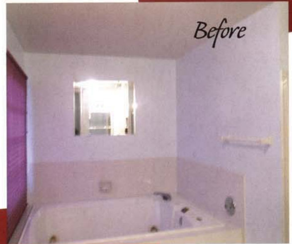
DESIGN AND CONSTRUCTION: Sonny Nazemian, Michael Nash Custom Kitchens & Homes, Fairfax, Virginia.

3. MATERIALS: The designer tiled the entire bathroom and shower in Empress Green marble; countertops and a custom tub surround were cut from matching marble slabs. The shower features both a rain shower and hand-held spray. Glass blocks on the windows and in the commode area provide privacy while letting in plenty of light.